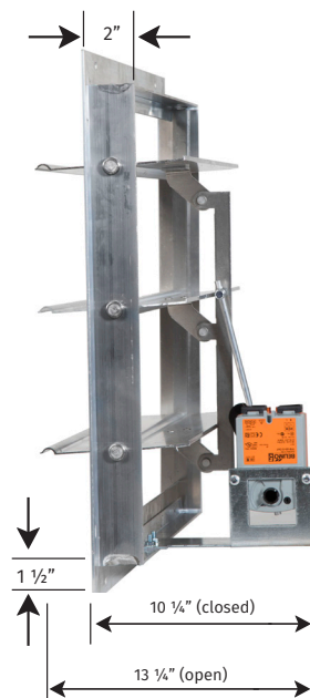
SIDE VIEW (12" to 24")