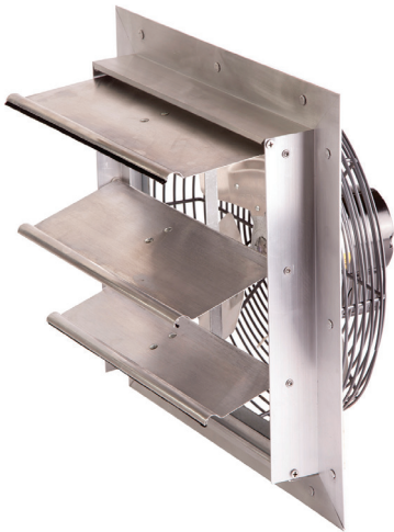
Shutter-Mount Exhaust Fan - SMF 12A