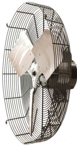
Guard-Mount Exhaust Fan - GMF 12A