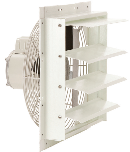
Fiberglass Shutter-Mount Exhaust Fan - CRF 16A